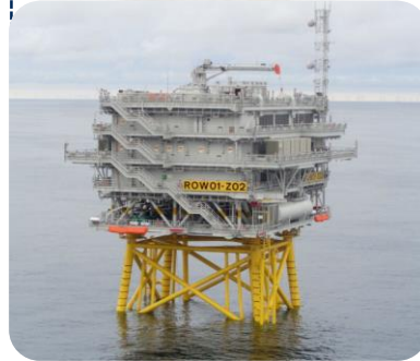
AC Substations 1)